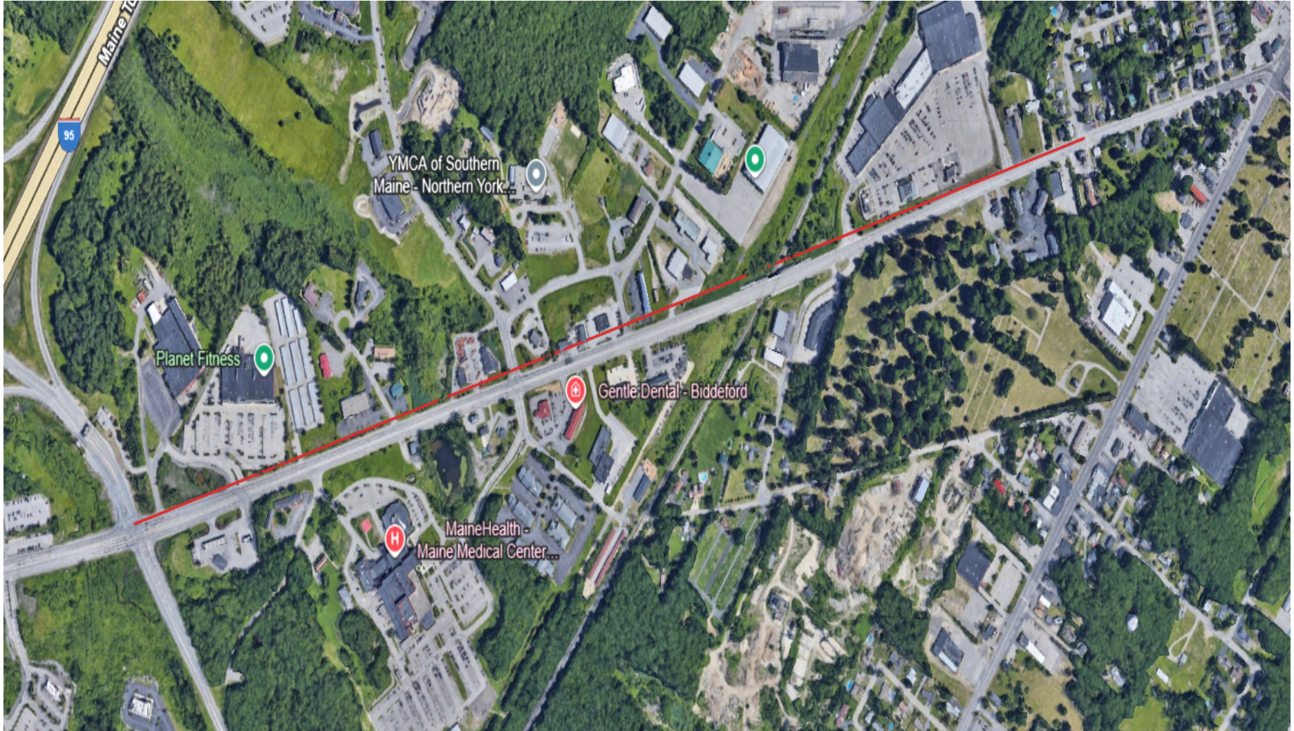
Exhibit B. Rt. 111 (Alfred Street) in red is point to point entrance from Maine Turnpike to May Street. Distance is 1.08 miles